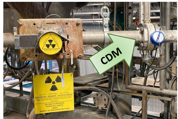
The CDM installed in the same line as where the radiation-based density meter is measuring density